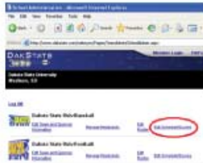
Figure 9: Edit Schedules and Scores