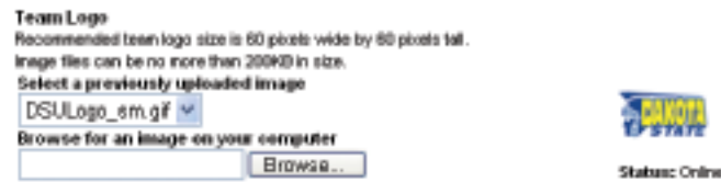
Figure 5: Edit Team Logo

Team Logo – Click the Browse button under the Team Logo heading and browse to the location you have a logo saved. Click Open . NOTE: Your logo must be formatted at 72 dots per inch (dpi) and should be 60 x 60 pixels.