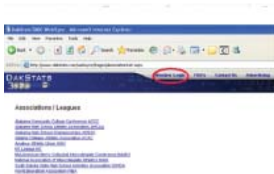
Figure 1: Member Log In