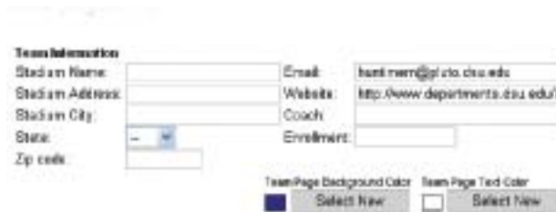
Figure 4: Edit Team Information