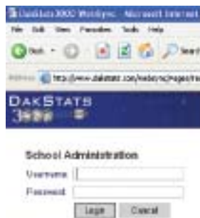
Figure 2: Username and Password

NOTE: If you require your username and password, please contact the CCAA Coordinator of Marketing and Media Relations.