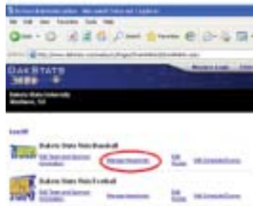
Figure 7: Manage Headshots